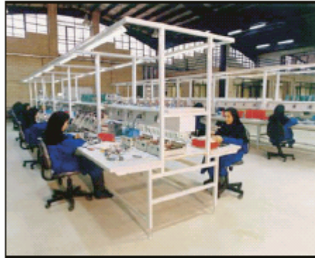
Production line in factory